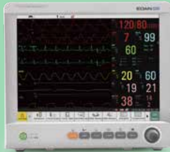
iM80 Patient Monitor